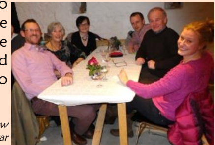
The Slackhead Slackers planning how they 'could do better' next year