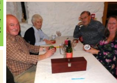
The winning Halers team

Competition was fierce and it was a close run battle, but the eventual victors were the 'Halers', with the Heron Heroes in second place