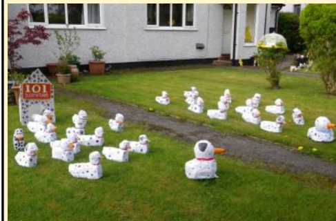
Biggest Effort '101 Duckmatians'