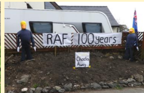
Topical Theme (tied) 'RAF 100 years'