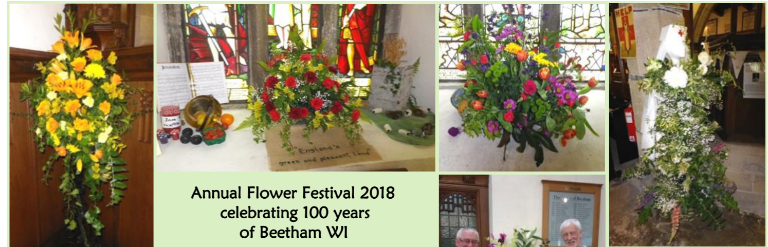
Annual Flower Festival 2018 celebrating 100 years of Beetham WI