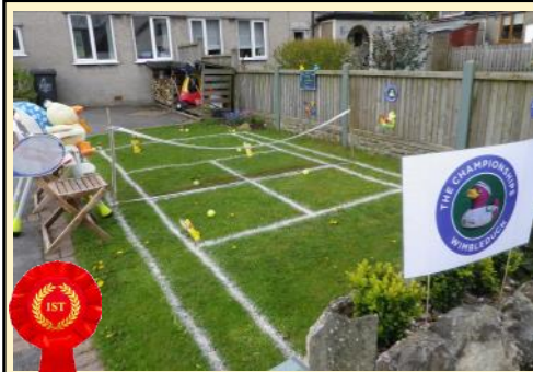
First Prize 'Wimbleduck'