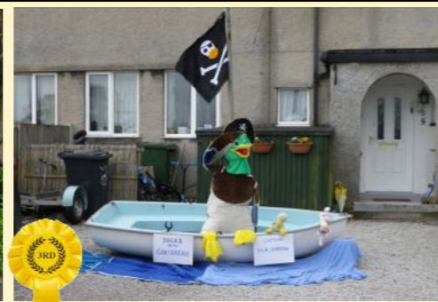
Third Prize 'Ducks of the Caribbean'