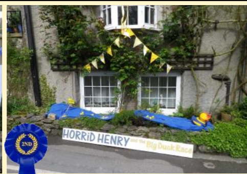
Second Prize 'Horrid Henry and the Big Duck Race'