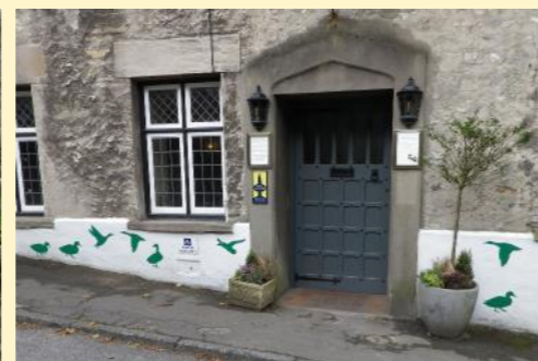
Best Newcomer 'Wheatsheaf Flying Ducks'

Kent Estuary Est. 1979 Travel 24 Hours. Competitive Rates