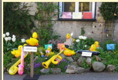
Best WOW Display 'Beetham Band'