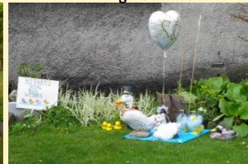
Topical Theme (tied) 'Beetham Royal Wedding'