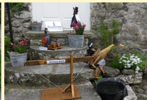
Best Original Idea 'Drakonian Punishments'