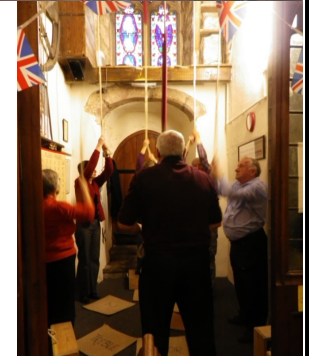
VE Day Pew Party