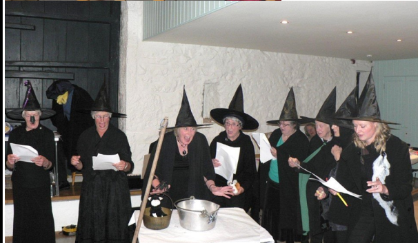
Harvest Supper ~ Much Ado About Nothing