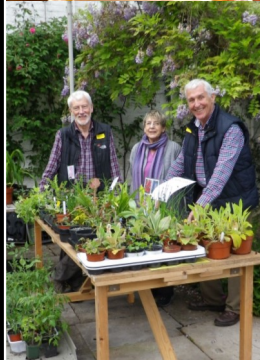
Dallam Open Garden Plant Stall