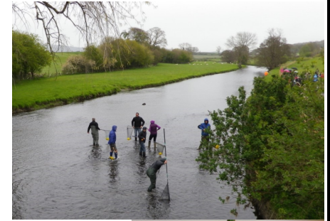
Annual Duck Race