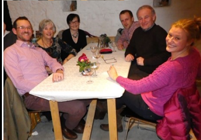
Shrove Tuesday Supper & Quiz