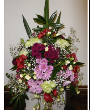
Flower Festival & Exhibition