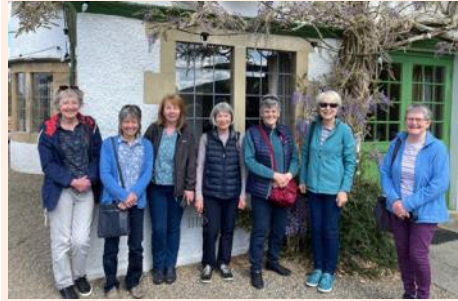
Outside Broad Leys

Towards the end of April – and in glorious sunshine – a group from Beetham WI enjoyed an informative and interesting guided tour, organised by 'Lakeland Arts', of two impressive "Arts & Crafts" country houses overlooking Windermere. Broad Leys, designed by C.F.A Voysey, is now the home of the Windermere Motor Boat Racing Club and Blackwell was designed by Mackay Hugh Baillie Scott. A delicious cream tea at Blackwell was appreciated by everyone!