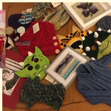
Photos of some of the entries created by Beetham members.